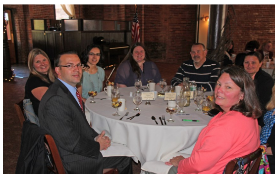
Out and About:: CF, CV, and Harpursville at Sharing the Vision: Partnerships for 21st Century Libraries May 19, 2014